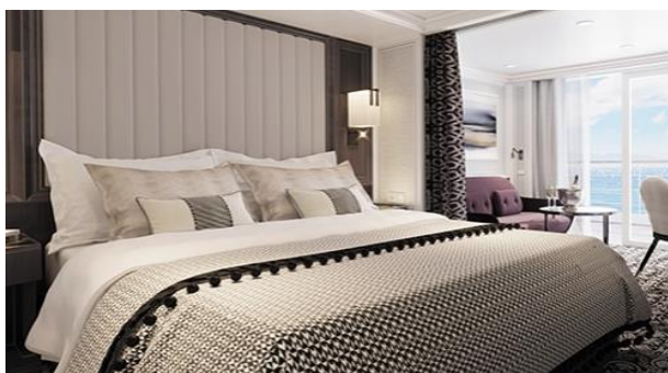
VERANDA SUITE – H 28 SQM