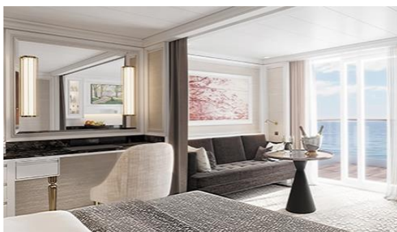
SUPERIOR SUITE – F 38 - 43 SQM.