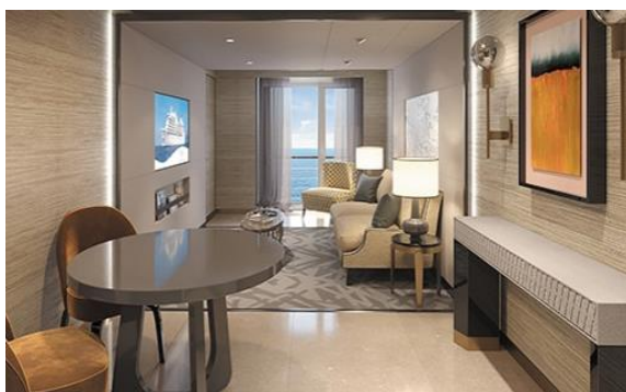
SPLENDOR SUITE – SP 76 - 85 SQM.