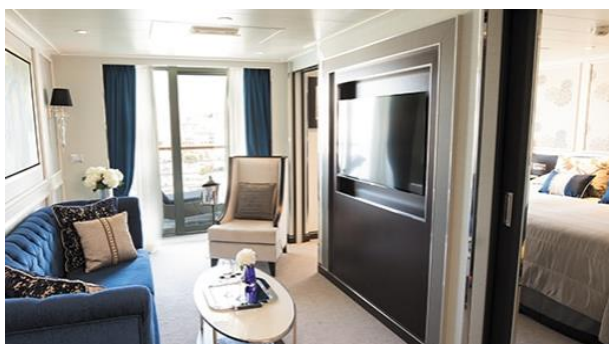
PENTHOUSE SUITE – A 52-59 SQM.