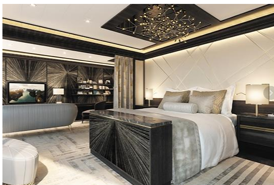
REGENT SUITE – RS 412 SQM

PENTHOUSE SUITES AND HIGHER INCLUDE: FREE Personal Butler and more