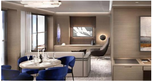
The Signature Suite (44+9 sqm.) Fares from $13,747