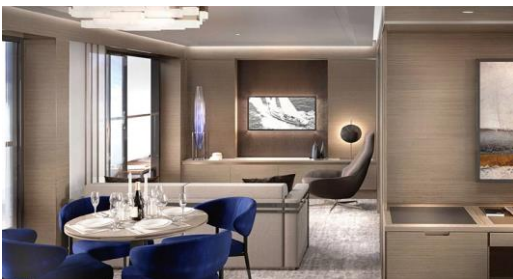
The Signature Mid Suite (44+9 sqm.) Fares from $14,447