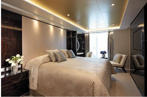
REGENT SUITE 413 SQM

ALL FARES INCLUDE: Unlimited Shore Excursions, FREE Unlimited Beverage Including Fine Wines and Premium Spirits, FREE Open Bars and Lounges Plus In-Suite Mini-Bar Replenished Daily, FREE Pre-Paid Gratuities, FREE Specialty Restaurants, FREE Unlimited WIFI