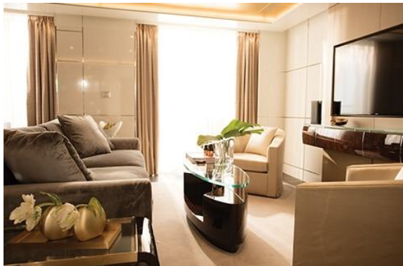
SEVEN SEAS SUITE 76 SQM.