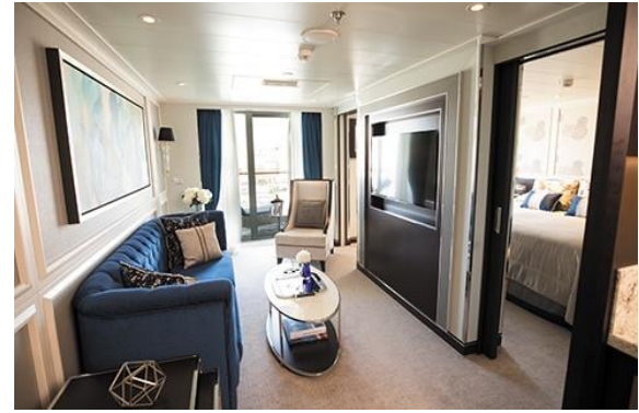
PENTHOUSE SUITE 52-60 SQM.