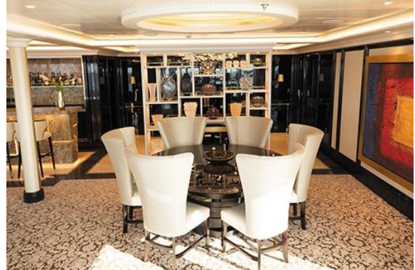
EXPLORER SUITE 76-85 SQM.