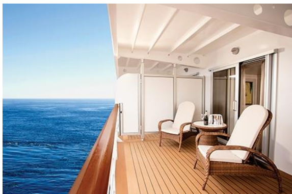
CONCIERGE SUITE 39-43 SQM.