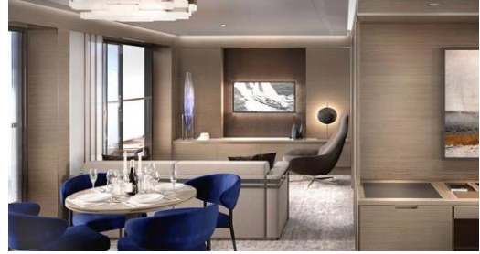
The Signature Suite (44+9 sqm.) Fares from $14,419