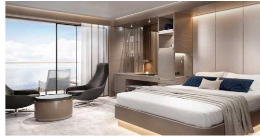
The Terrace Suite (29+6 sqm.) Fares from $9,219

Fares are per person based on double occupancy. Taxes, fees and port expenses of US$1,119 per passenger are included. Fares, taxes, and port charges are subject to change without notice. Deposit payment 25% of the cruise fare is required to confirm the booking. Guest cancellation schedule applies.