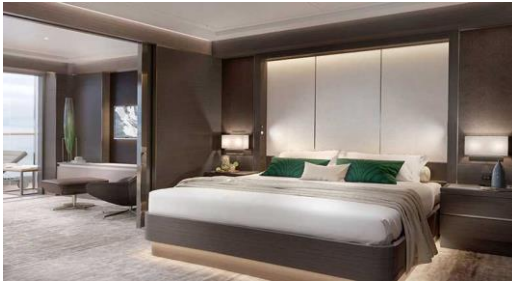
The Grand Suite (59+10 sqm.) Fares from $19,219