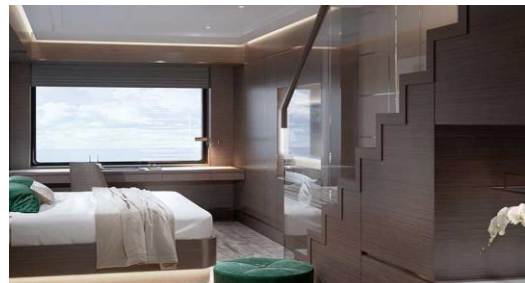
The Loft Suite (65+7 sqm.) Fares from $17,519