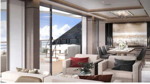
The Owners Suite (102+55 sqm.) Fares from $38,919