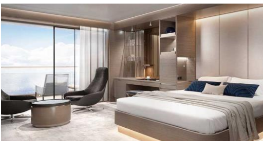
The Terrace Mid Suite (29+6 sqm.) Fares from $9,519