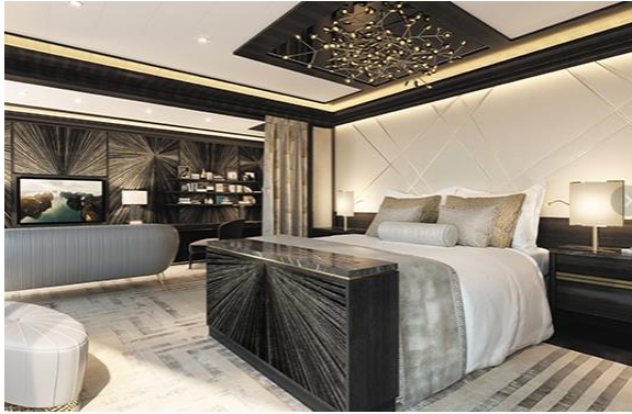
REGENT SUITE – RS 412 SQM

ALL FARES INCLUDE: Unlimited Shore Excursions, FREE Unlimited Beverage Including Fine Wines and Premium Spirits, FREE Open Bars and Lounges Plus In-Suite Mini-Bar Replenished Daily, FREE Pre-Paid Gratuities, FREE Specialty Restaurants, FREE Unlimited WiFi