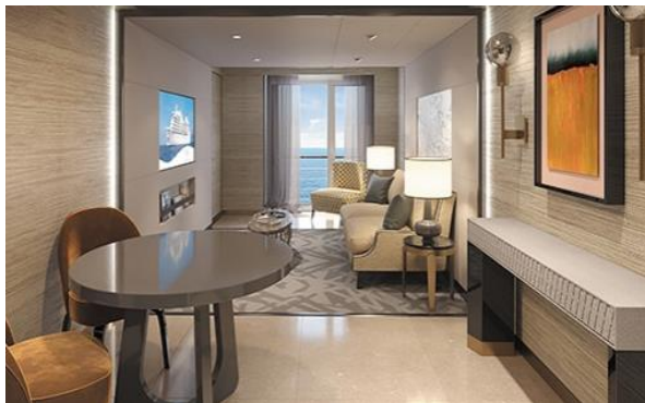
SPLENDOR SUITE – SP 76 - 85 SQM.