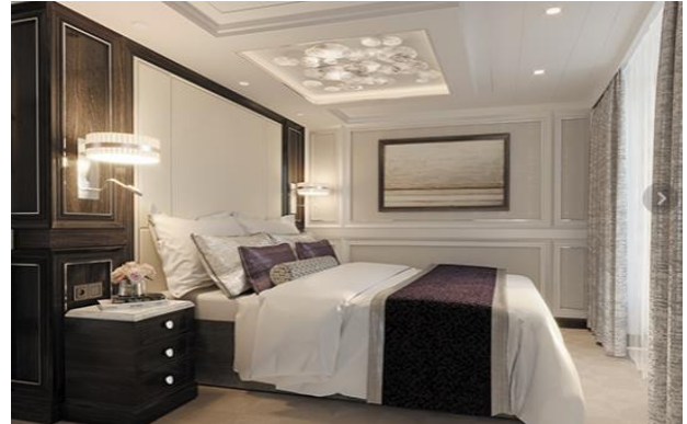
MASTER SUITE – MS 176 - 195 SQM.