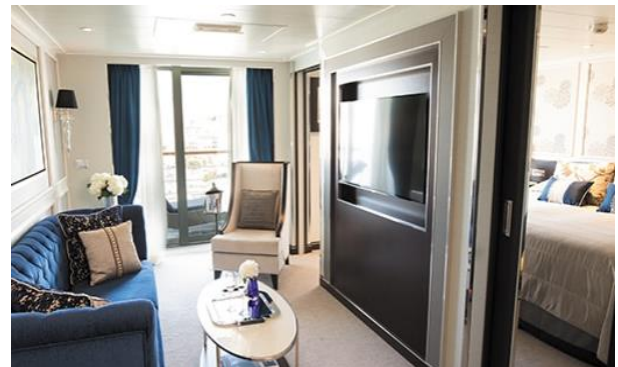
PENTHOUSE SUITE – A 34 SQM.