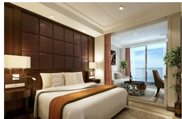
DELUXE VERANDA SUITE 29-34 SQM.