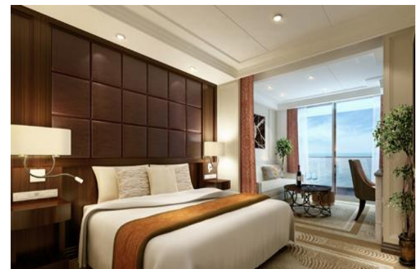
DELUXE VERANDA SUITE 29-34 SQM.