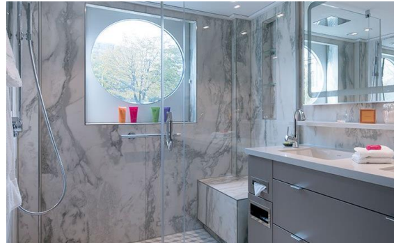
Two-Bedroom crystal suite with panoramic balcony window