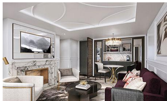
One-Bedroom crystal penthouse with panoramic balcony window