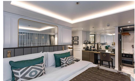
Deluxe Suite with panoramic balcony-window