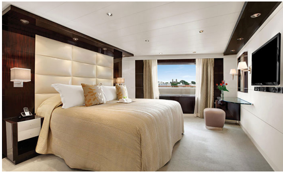
Owner's Suite 185 sqm