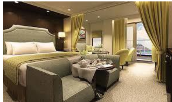
Penthouse Stateroom 39 sqm.