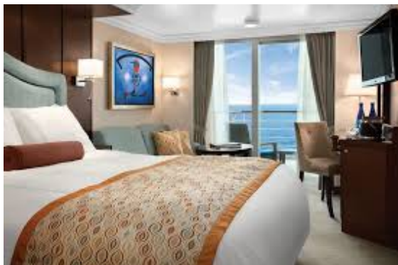
Veranda Stateroom 26 sqm.