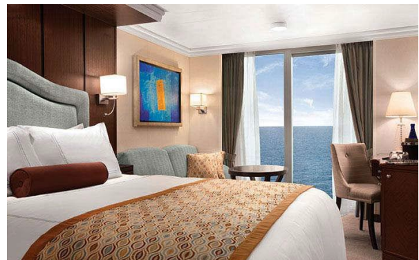
Deluxe Ocean View 22 sqm.

Deck 9: Soraya 082-651-8222, Bee 087-495-9355, Anne 082-414-5556