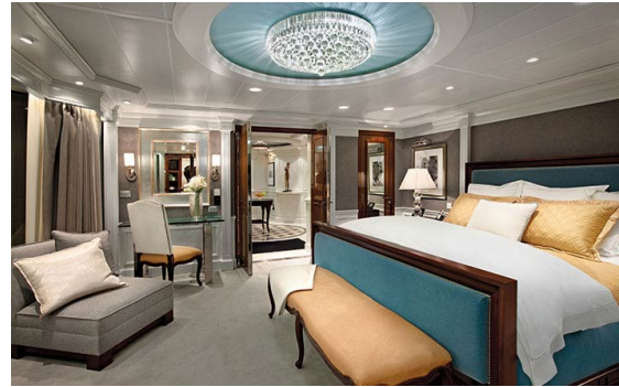
Vista Suite 111 -140 sqm