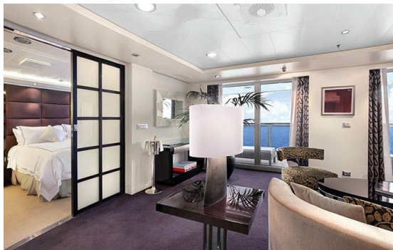
Oceania Suite 92 sqm